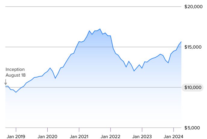
● Growth Fund

If you had invested $10,000 at inception, the graph below shows what it would be worth today, before fees and tax.